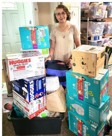
Volunteer at Allied Women's Center receives donations from our collection

An abundance of baby items — diapers, baby wipes, clothing, and other necessities for new moms — was collected through the always-generous donations of our parishioners in the May "Baby Shower" collection. The items were delivered to the Allied Women's Center (see thank-you note below), and to A Woman's Haven, which is located directly across from the big Planned Parenthood abortion facility in the medical center. Both of the pregnancy support facilities work non-stop to assist women in crisis pregnancy situations who are at a point where abortion seems to be their only option. These facilities bring authentic compassion, spiritual aid, practical assistance, and baby necessities to the moms before the baby's birth, and during the early months of baby's life. Without this help, many women would face the despair of "no other choice."