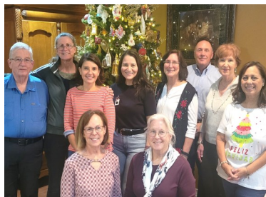
SVDP members from OLA gather at the home of one of our members to sort all the gifts and deliver to recipients.

This past December, the OLA SVDP members delivered 150 gifts to recipients in our parish and neighboring community. It is truly a joy to witness the giving spirit of the families in our parish, and even more joyful to experience the gratitude of those who receive the gifts.